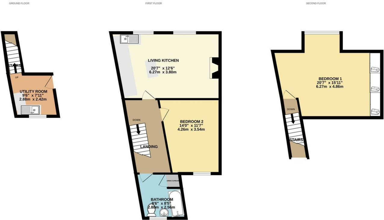
2 BEDROOM DUPLEX APARTMENT

Whilst every attempt has been made to ensure the accuracy of the floorplan contained here, measurements of doors, windows, rooms and any other items are approximate and no responsibility is taken for any error, omission or mis-statement. This plan is for illustrative purposes only and should be used as such by any prospective purchaser. The services, systems and appliances shown have not been tested and no guarantee as to their operability or efficiency can be given. Made with Metropix ©2025